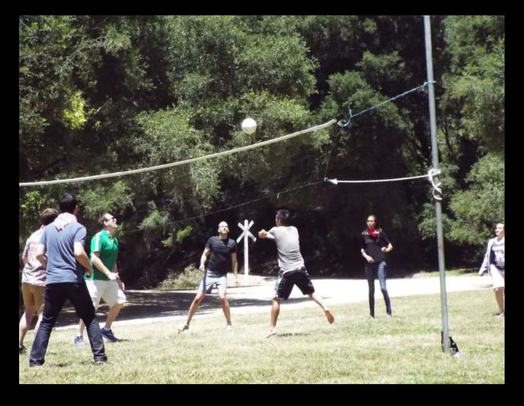
Free team building activities: Volleyball, horseshoes, bocce ball, bingo and nature walks